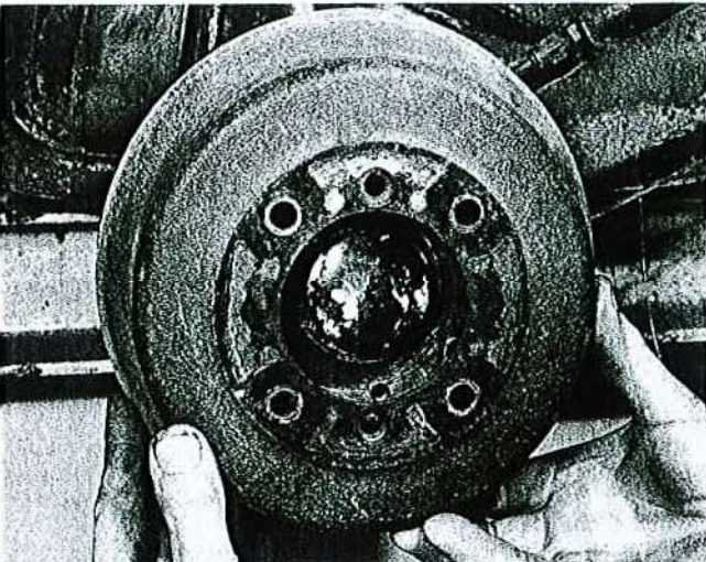
4.5 ...and withdraw the drum

and then undo and remove the two brake drum retaining screws (photo).